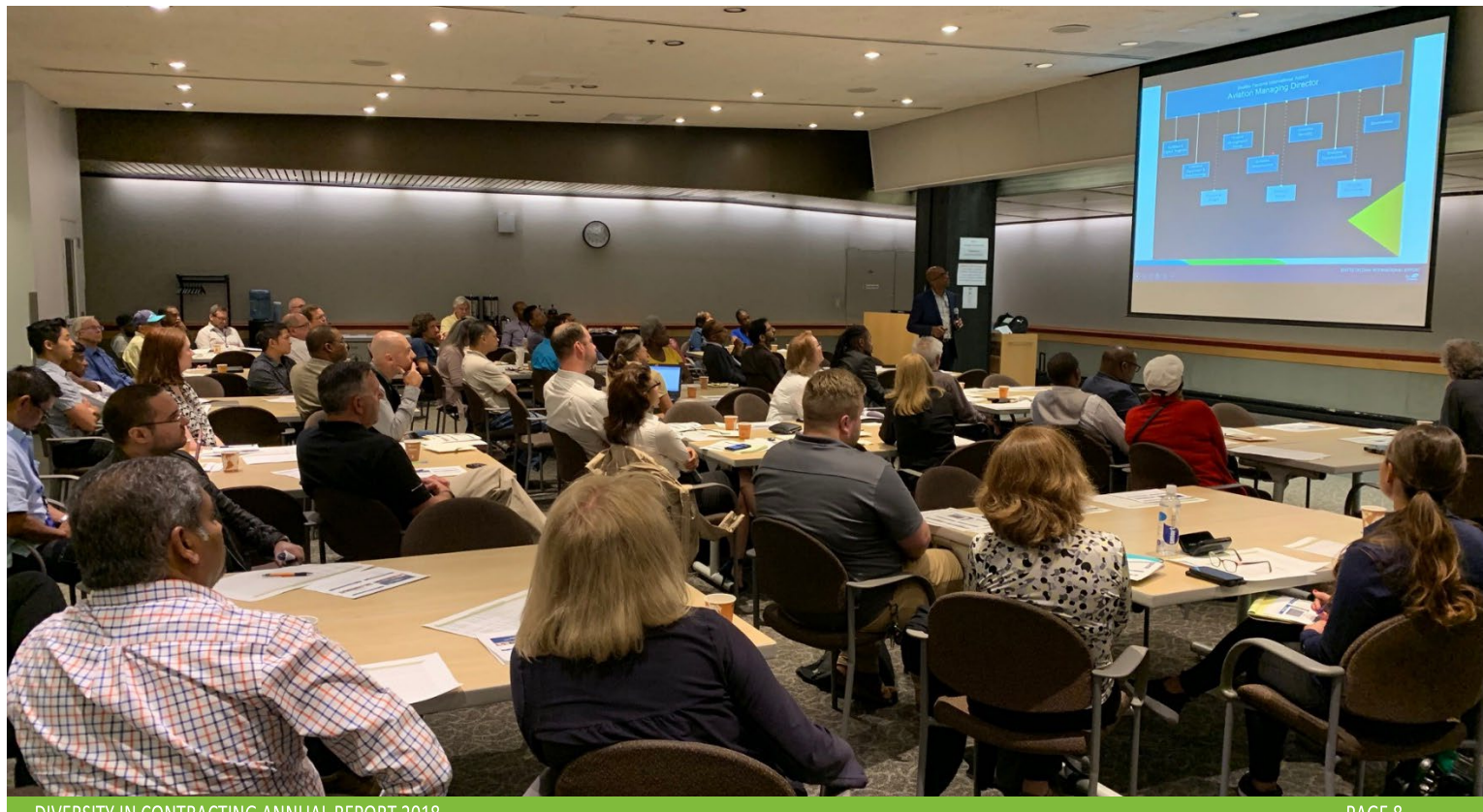
DIVERSITY IN CONTRACTING ANNUAL REPORT 201

And, it does not stop there. We are acting on the Commission and Executive Leadership Team's directive for Port staff to buy more WMBE goods and services. These affirmative steps will help each Port division or department achieve its aspirational goals.